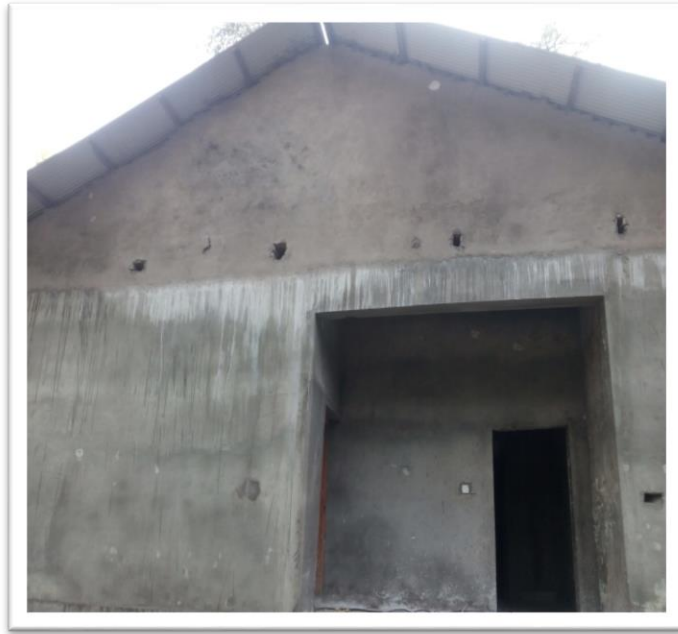
Side view of motel

The outlined portion shows maroonish texture which indicates the use of sub-standard sand with considerable %age of clays which is not recommended