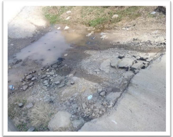
Access road is damaged due to poor water Management, x-drainage and culvert or causeway needed