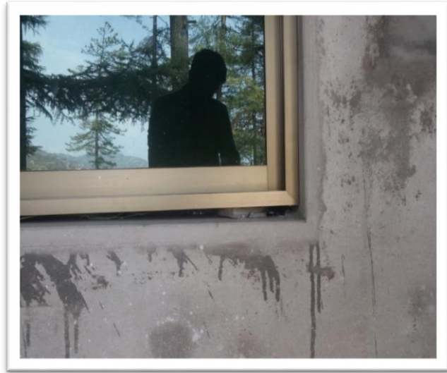
Poor Alignment of window