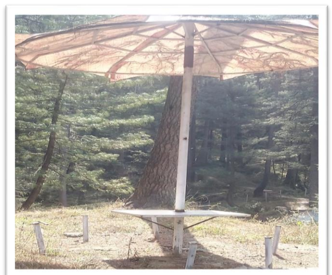
Damaged fiber glass canopy even before the execution of project