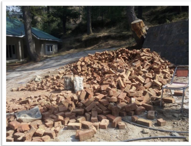
Use of substandard bricks was observed

The outlined portion shows maroonish texture which indicates the use of sub-standard sand with considerable %age of clays which is not recommended